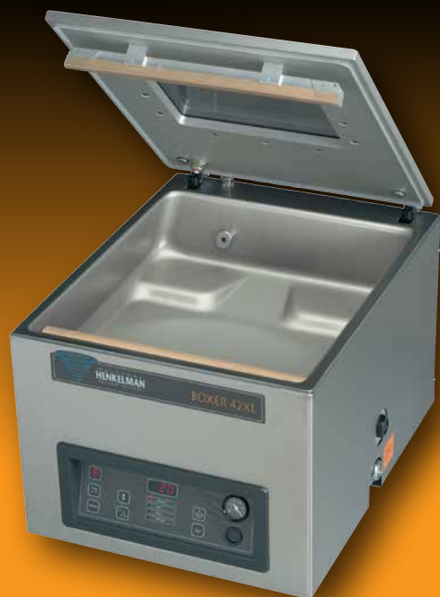
BOXER 42 XL Bi-ACTIVE